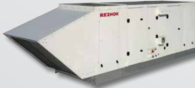
Split HVAC System