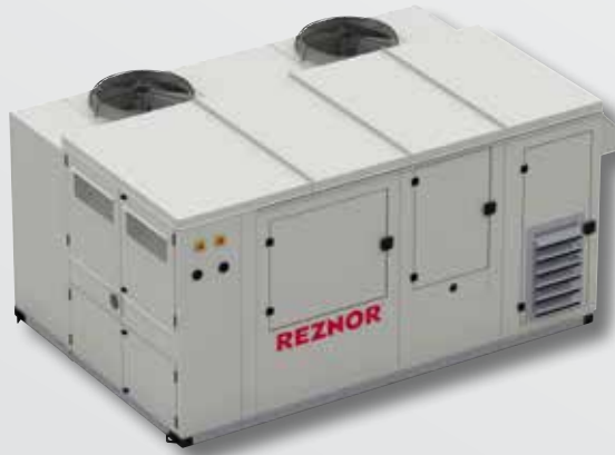
Packaged HVAC System