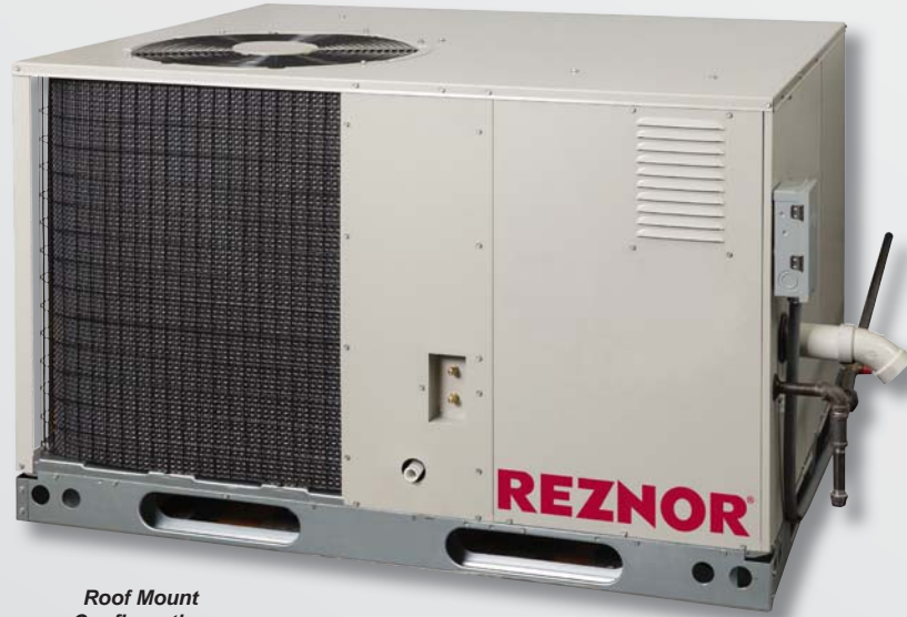
Roof Mount Configuration

Ultra High Efficient, Gas/Electric 95% AFUE, 14 SEER Packaged System Roof or Slab Mount