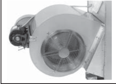
FIGURE 2 - Blower Inlet Guard Installed

Installation should be done by a qualified agency in accordance with these instructions and in compliance with all codes and requirements of authorities having jurisdiction.