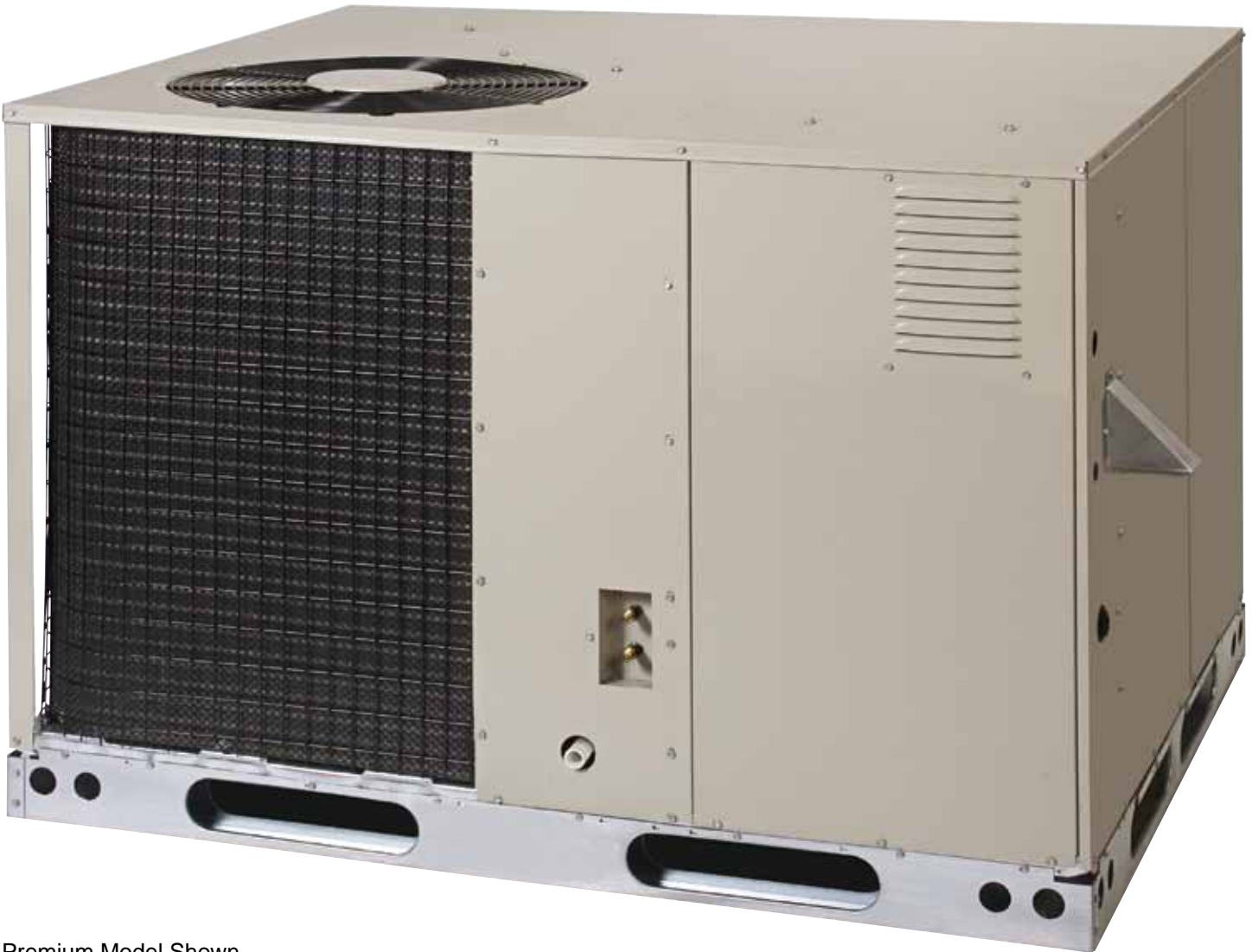
Premium Model Shown

Gas Heating / Electric Cooling Package Units 13 SEER, 3-Phase, 460V Models R6GD Series