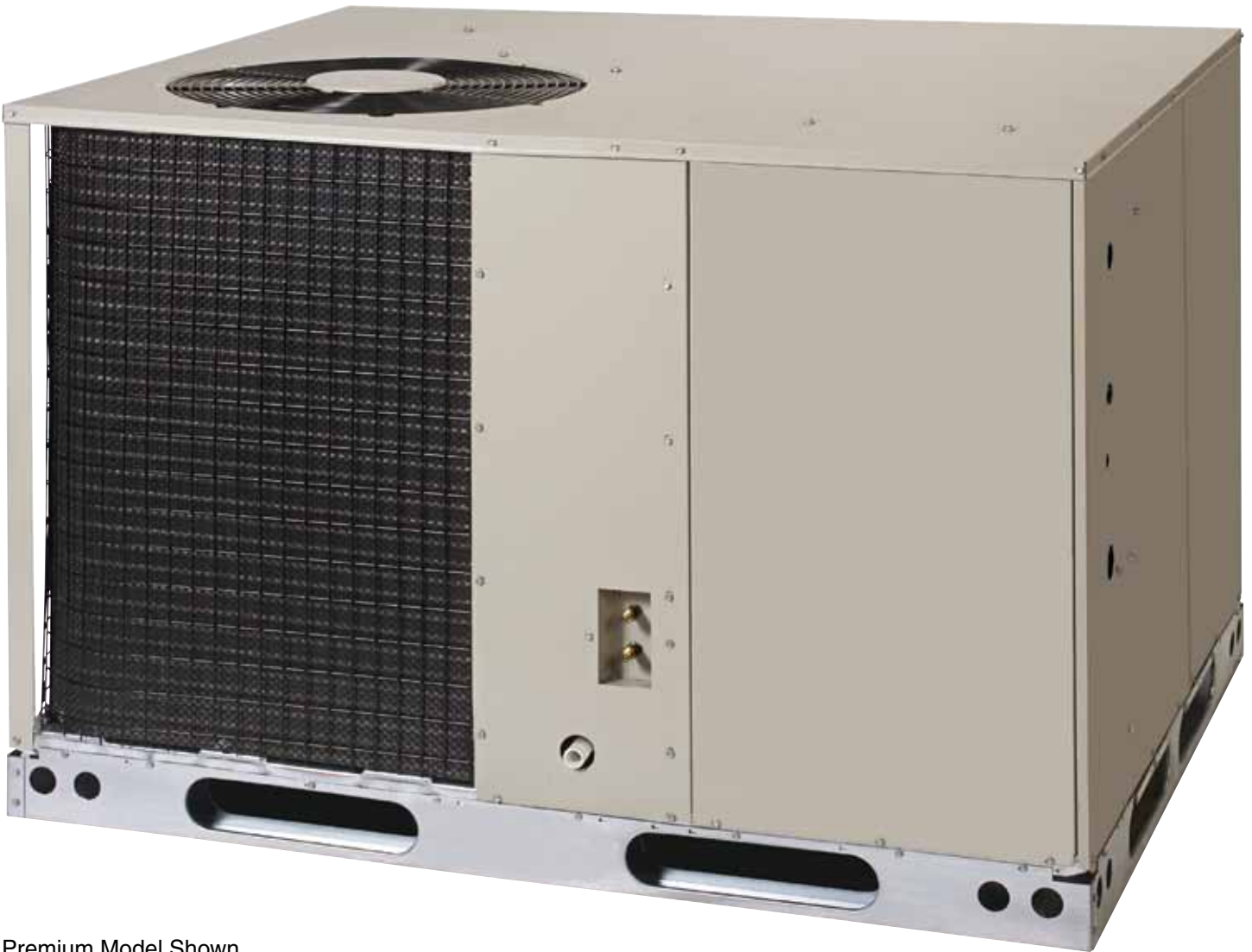
Premium Model Shown