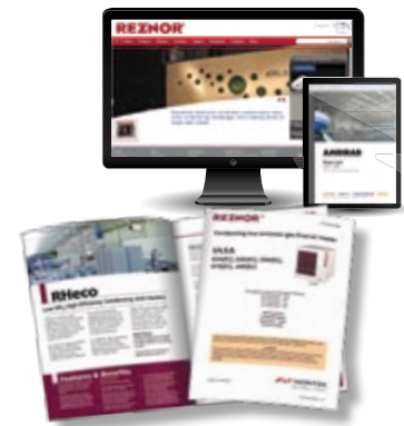
Example of the documentation that must be supplied

However, product literature and manufacturer web sites must indicate the seasonal efficiency and NO x emissions for each product or system.